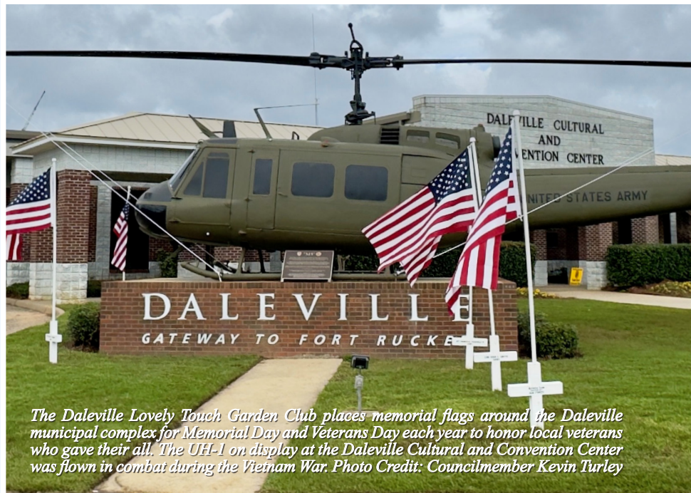
The Daleville Lovely Touch Garden Club places memorial flags around the Daleville municipal complex for Memorial Day and Veterans Day each year to honor local veterans who gave their all. The UH-1 on display at the Daleville Cultural and Convention Center was flown in combat during the Vietnam War.

★ ACE was established in 2002 as a 501(c)(3) organization to provide technical assistance to select smaller communities in an effort to strengthen long-term economic success. Through a comprehensive, three-phase approach, ACE uses the collective expertise of its partner organizations - ranging from state agencies