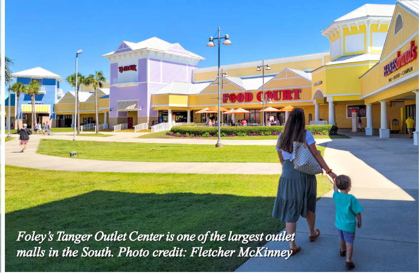
Foley's Tanger Outlet Center is one of the largest outlet malls in the South.

We are proud of Foley for taking part in our programs, representing our state on the highest level and making big waves along our Gulf Coast. We cannot wait to see what the next 10 years have in store for this community! ■