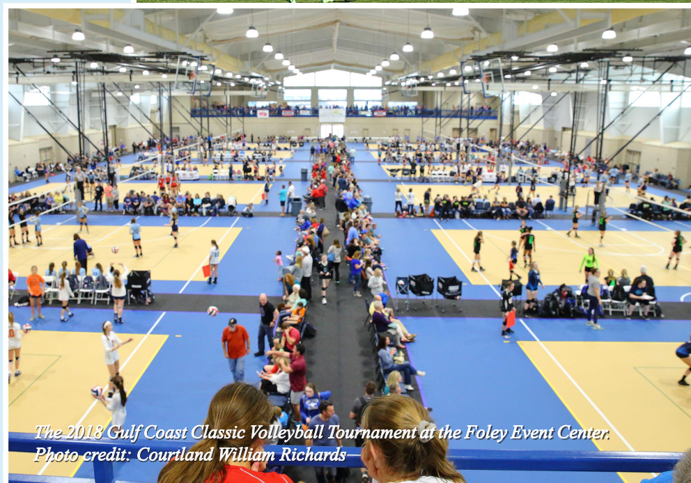
The 2018 Gulf Coast Classic Volleyball Tournament at the Foley Event Center.