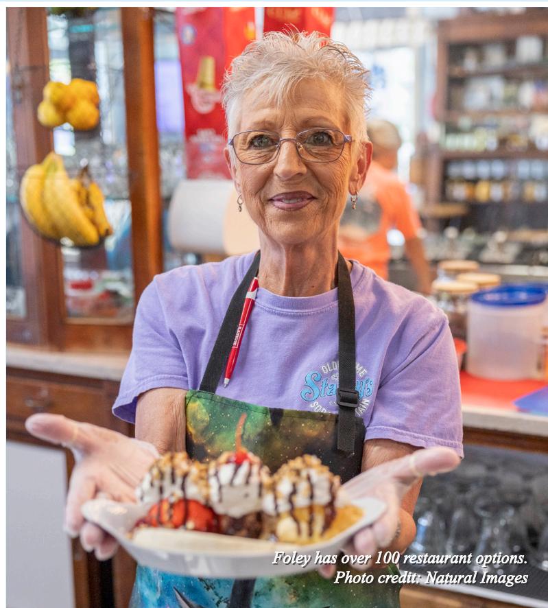
Foley has over 100 restaurant options.

After all public input and research is gathered, the mayor hopes the city can finalize its strategic plan by the summer. Among the top priorities, this plan will include four major projects that are currently in the works. The first consists of building a new $17 million state-of-the-art public works facility to replace the current