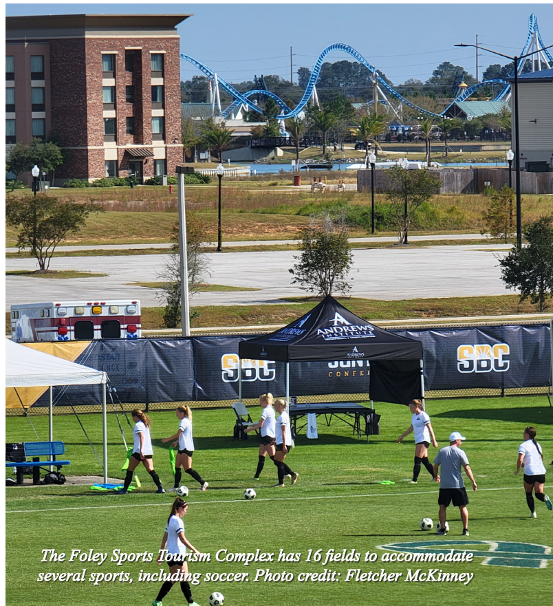
The Foley Sports Tourism Complex has 16 fields to accommodate several sports, including soccer.

While the outlets are at the center of commerce for Foley, city leadership is working on creating a more lively downtown. The Foley Downtown Historic District is listed on the National Register of Historic Places and contributes greatly to the city’s culture, history and quality of life. Last year, the Foley Railroad Museum and Model Train Exhibit greeted right at 20,000 visitors and the Holmes Medical Museum greeted over 11,000 visitors. These museums are free to the public and are operated by the city to add to the visitor experience downtown.