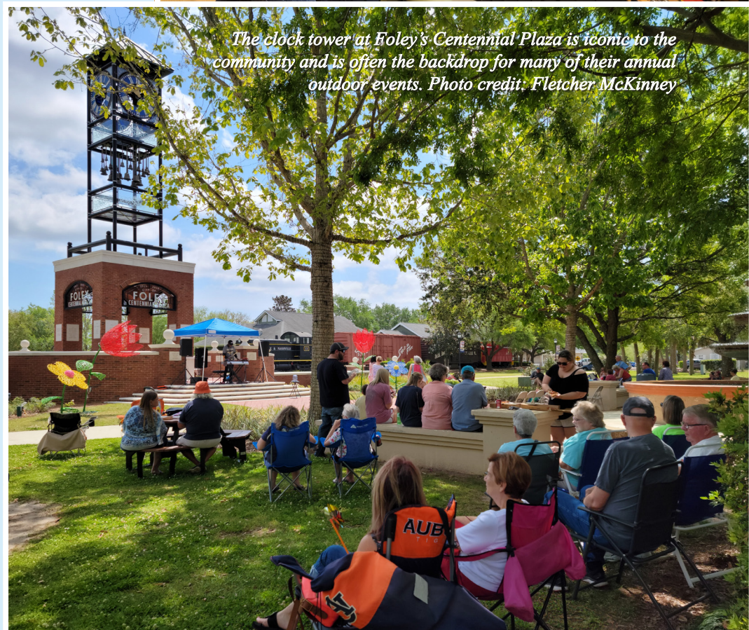
The clock tower at Foley's Centennial Plaza is iconic to the community and is often the backdrop for many of their annual outdoor events.