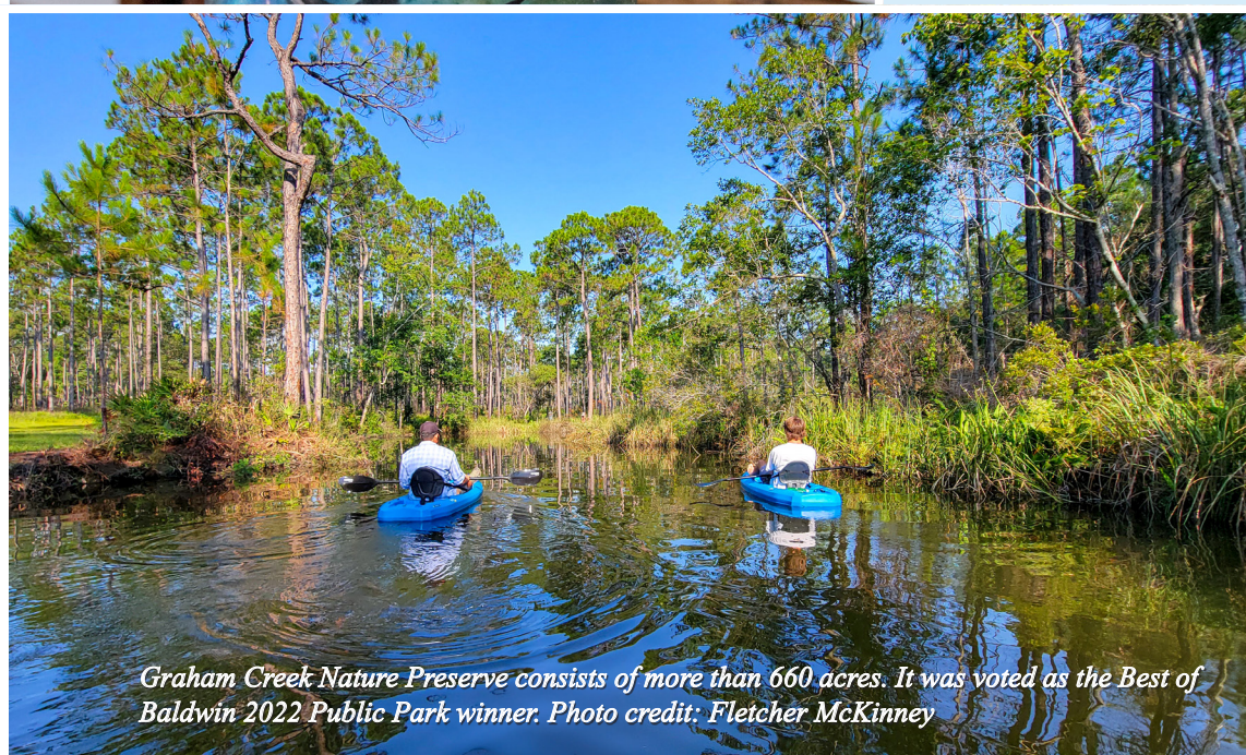
Graham Creek Nature Preserve consists of more than 660 acres. It was voted as the Best of Baldwin 2022 Public Park winner.